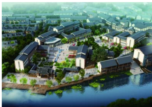
Fig. 4. The transform effect picture along the river.