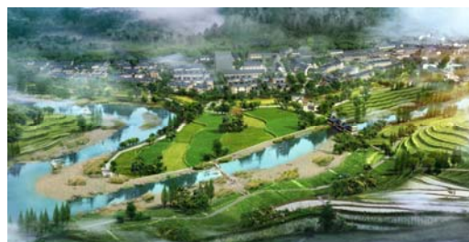
Fig. 5. Scenograph of dwelling and field.

Apply the landscape design method of "from up to down", to pursue the origin and keep the original rural cultures and settlements. Apply the local materials and construct the rural landscape with distinct characteristics. In order to continue the rural feelings, by protecting the mountain, river, and making afforestation, ploughing the fields, construct the roads and house, to emerge the Tujia culture into the construction of the landscape environment. Using the river to bunch all the views and establish cultural activity places along the river landscape. In the meantime, use the Tujia elements in the architectural design for presenting the willingness of "seeing the mountain and river and memorializing the nostalgia" by the local people (see Fig. 5 and Fig. 6)