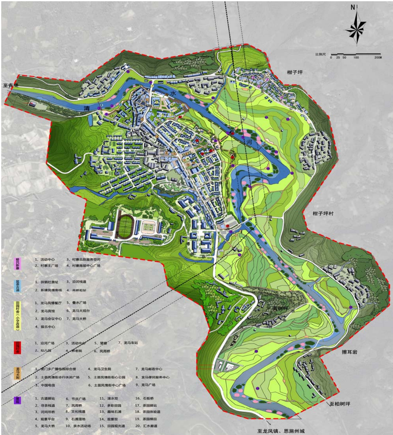
Fig. 3. The overall planning of Longma town.

Control the construction scale and strength appropriately should be paid much attention to.