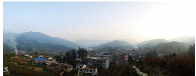
Fig. 1. Longma town in Enshi prefecture.

Longma Village is in the northwest of Longfeng Town, which is 37 miles from Enshi Prefecture. The old highway traverses all the district and the new highway will be planned to traverse the north bank of Qingshui River. The village has 7 administrative villages with about 18,000 people and 128 square miles. In 2002, the Longma Village was canceled and merged into Longfeng Town (see Fig. 1). The basic ecological condition of this place is "huge mountains and few people". The average farmland resources for per person is 1 to 2 acre of land in the plain area while 3 to 5 acre of land in the mountainous area.