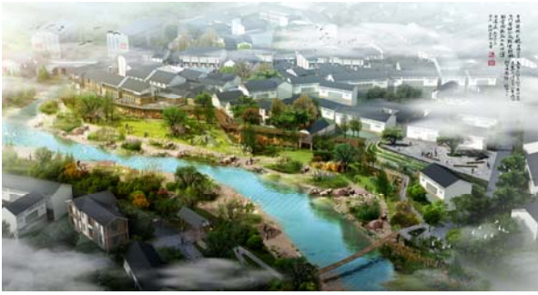
Fig. 6. Scenograph of the old road.