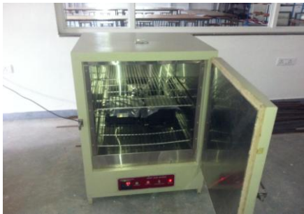
Fig. 2. Specimens wrapped with polythene cover in oven curing

The sodium hydroxide and the sodium silicate solutions were mixed together with superplasticizer then added to the dry materials and mixed for about four minutes. The fresh concrete was cast into the molds immediately after mixing, in three layers and compacted with manual strokes and vibrating table. After casting, the specimens were cured at 60 °C for 24 hours. Two types of curing were applied, Heat curing and Ambient curing. For heat curing, the specimens were cured in an oven as shown in Fig. 2 and for Ambient curing the specimens were left to air for desired period.