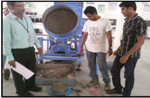
Fig. 1. Pan Mixture used for mixing the proportions of geopolymer concrete.

The sodium hydroxide flakes were dissolved in distilled water to make a solution with a desired concentration at least one day prior to use. The fly ash and the aggregates were first mixed together in a pan mixer for about three minutes.