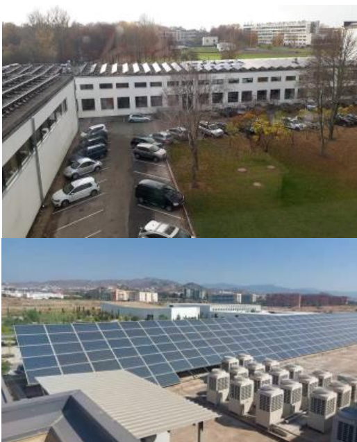
Fig. 4. PV panels in Kaunas.

The University of Malaga, specifically at the School of Industrial Engineering and the Smart Malaga project, are excellent examples of how universities can integrate renewable energy technologies and intelligent systems to enhance energy efficiency and contribute to a more sustainable environment. The School of Industrial Engineering features a renewable energy production through photovoltaic solar power. It consists of a 1 MW photovoltaic installation (Fig. 4), effectively generating electricity from renewable sources, thus reducing dependence on non-renewable energy sources. Furthermore, the implementation of energy management systems that control heating, ventilation, and lighting is crucial to optimize energy usage and reduce waste. This involves tailoring energy consumption to specific needs, thereby enhancing efficiency. Also noteworthy is the integration of innovations for Smart Buildings. Being part of the Smart Malaga project showcases the university's commitment to innovation and the adoption of advanced technologies to decrease energy consumption and improve air quality in university buildings.