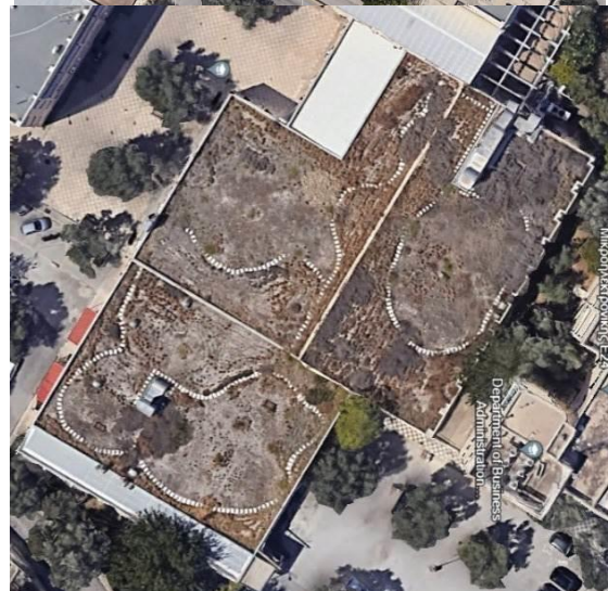
Fig. 3. Green roof top in Ancient Olive Grove Campus.

Improvements proposed has transformed the campus categorically, thus exceeding the objectives set in the 880kWp of PV divided in in 2 parts planning to cover the electricity needs of the 2 campuses of Egaleo Park and