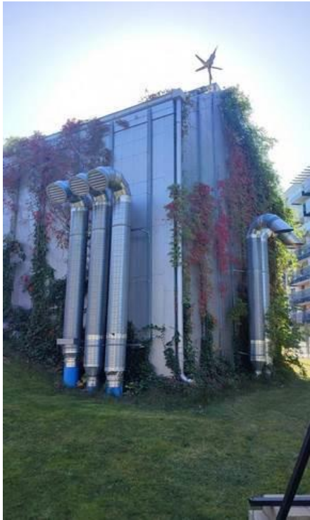
Fig. 1. Laboratory of Architecture.