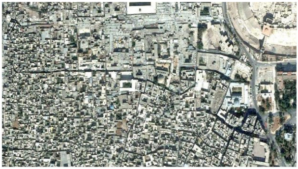
Fig. 1. Traditional urban fabric Aleppo, Syria .

The severe prevailing climate, in most regions in the Arab world, necessitates planning fabric and house forms well adapted to the ambient environment. City planning was the first step for thinking. Minimal sun-exposure in summer and therefore compactness and shade are the main principals for building in hot-arid zones. Hence, compact planning for groups of buildings is required in order to give shade to each other (Fig. 1).