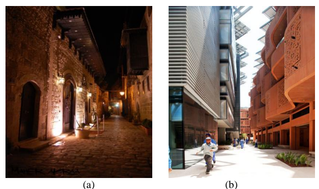
Fig. 2. (a) Narrow streets in old city of Aleppo. (b) Contemporary reinterpretation of Narrow streets.

And to provide a shaded network of narrow streets (Fig.2a) and small spaces in between as patio-like areas. Arcades, colonnades, cantilevered buildings or building components, membranes and small enclosed courtyards are traditional responses to the climate; even larger public open spaces should be enclosed, inward looking and shaded for most of the day [2].